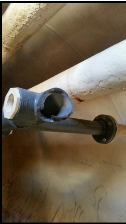
Broken Surface Wash Piping

ERS Industrial Services was hired to perform a routine detailed inspection of the filters, and multiple critical problems were identified, including broken piping, clogged wash jets, rusted and deteriorated lateral couplings, and failed areas in the steel bulkhead wall separating the filter cells as shown in the photos below.