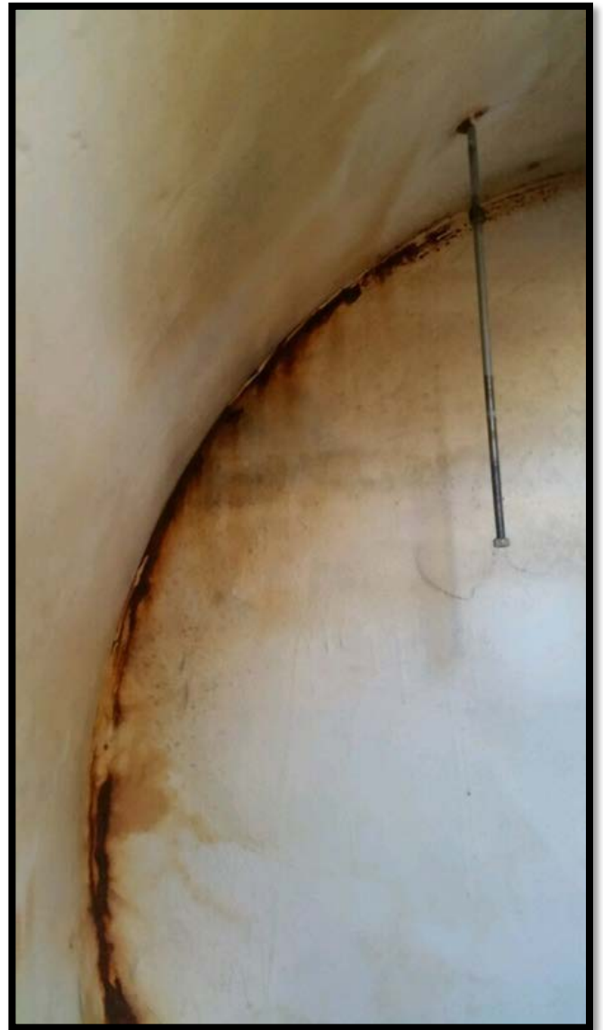
Corrosion, Holes and missing Coatings at Bulkhead

As the media was determined to be completely fouled, ERS was initially contracted on an emergency basis to simply remove and replace the filter media. The attached media replacement scope of work included herein as Exhibit B. After complete removal of the media, the root cause of the hydraulic filtering problems and media failure was identified. ERS has also provided a turnkey proposal for renovation of the filter; attached hereto as Exhibit A.