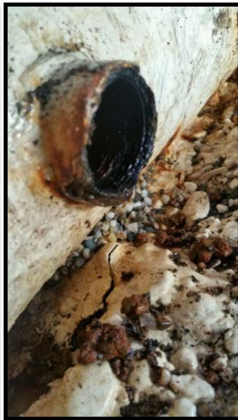
Rusted effluent manifold couplings