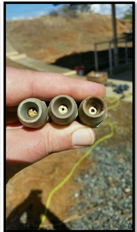
Clogged Surface Wash Nozzles