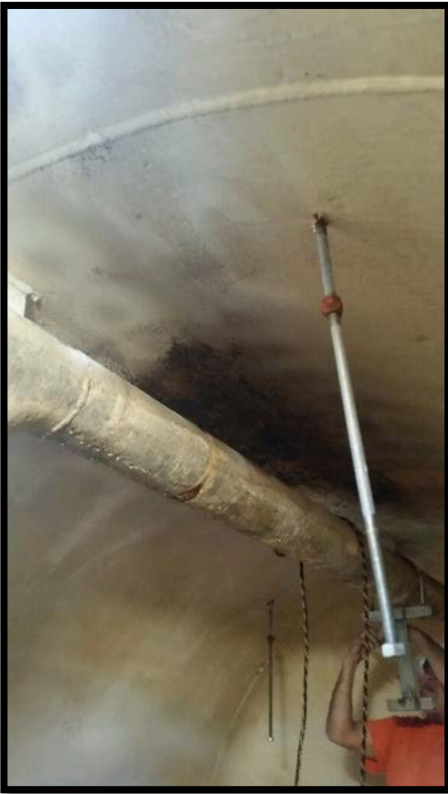
Rusted Coatings and Pipe