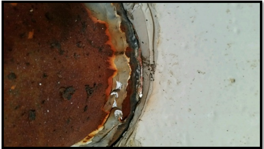
Severe Rust Around pipe penetrations